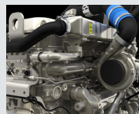
Off-highway Diesel & Natural Gas Engines